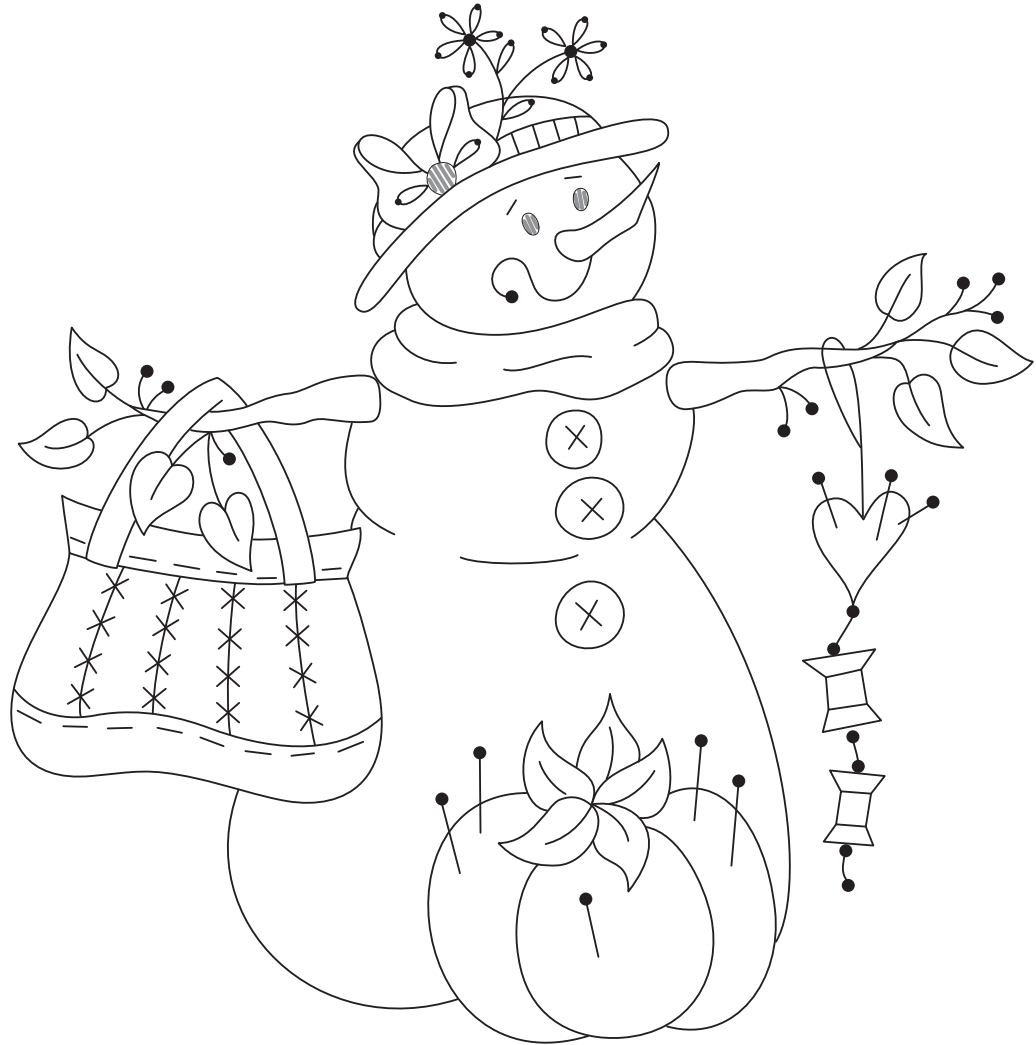
INDIGO GIRLS FULL-SIZE EMBROIDERY PATTERN B