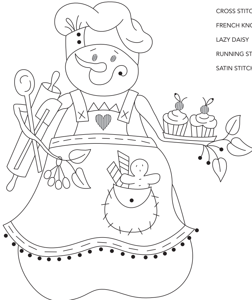
INDIGO GIRLS FULL-SIZE EMBROIDERY PATTERN A