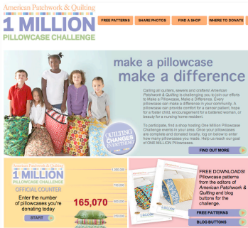
website / pillowcase counter