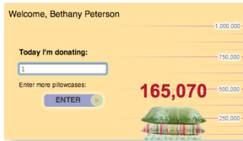
enter donation amount